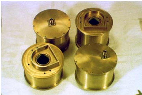
Antenna Couplers (Hats)

AntDevCo offers numerous types of antenna couplers (hats) for spacecraft and missile antennas. Contact us for custom designs